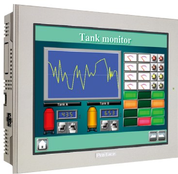
Pro-face® Graphic Operator Interface